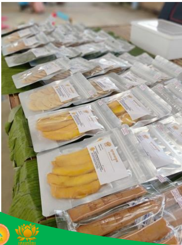
Dried Mango and other fruits